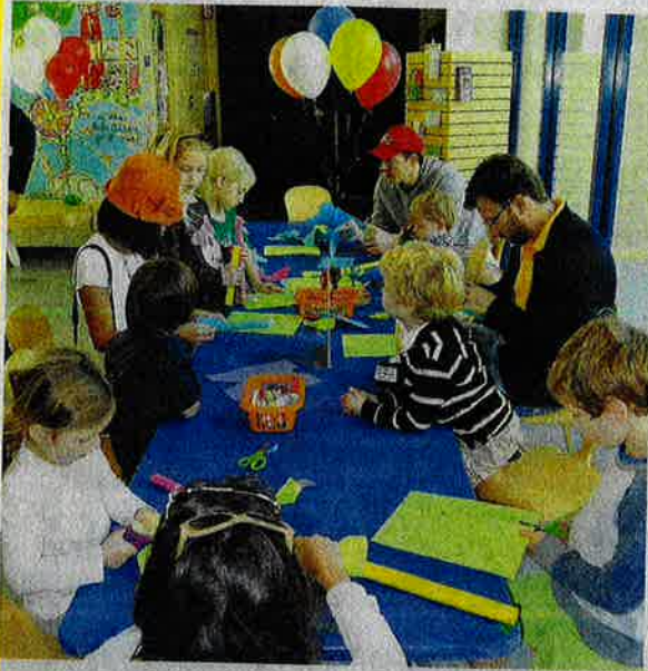
Children build stomp rocket at the Children's Museum of the East End's Rocket Day event held on Saturday.